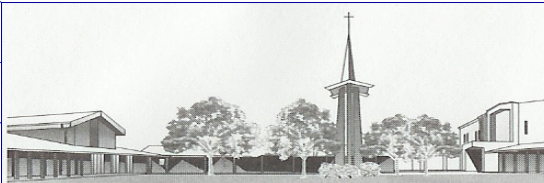
Our Savior Lutheran Church Living Faith Center